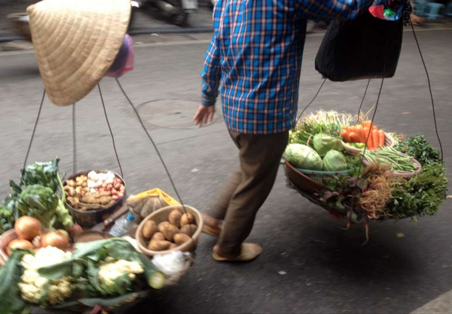
As an astounding variety of fresh vegetables passed by in bamboo baskets to the market.