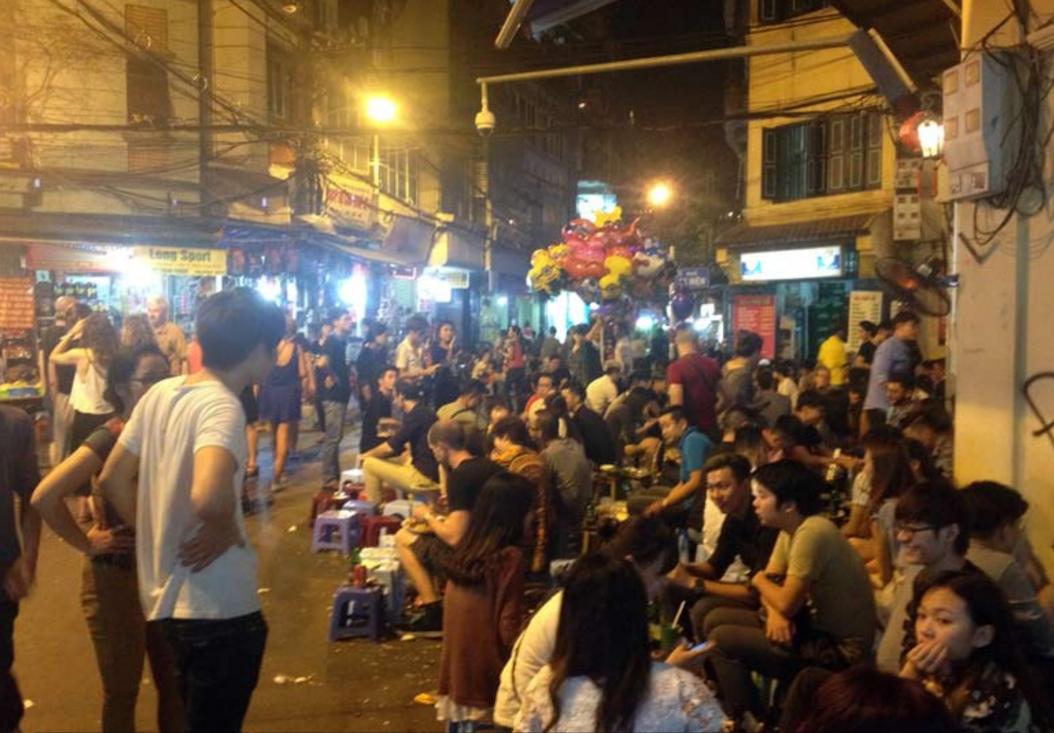
Hunger satisfied, I wandered through the Old Quarter to experience the city's nightlife.