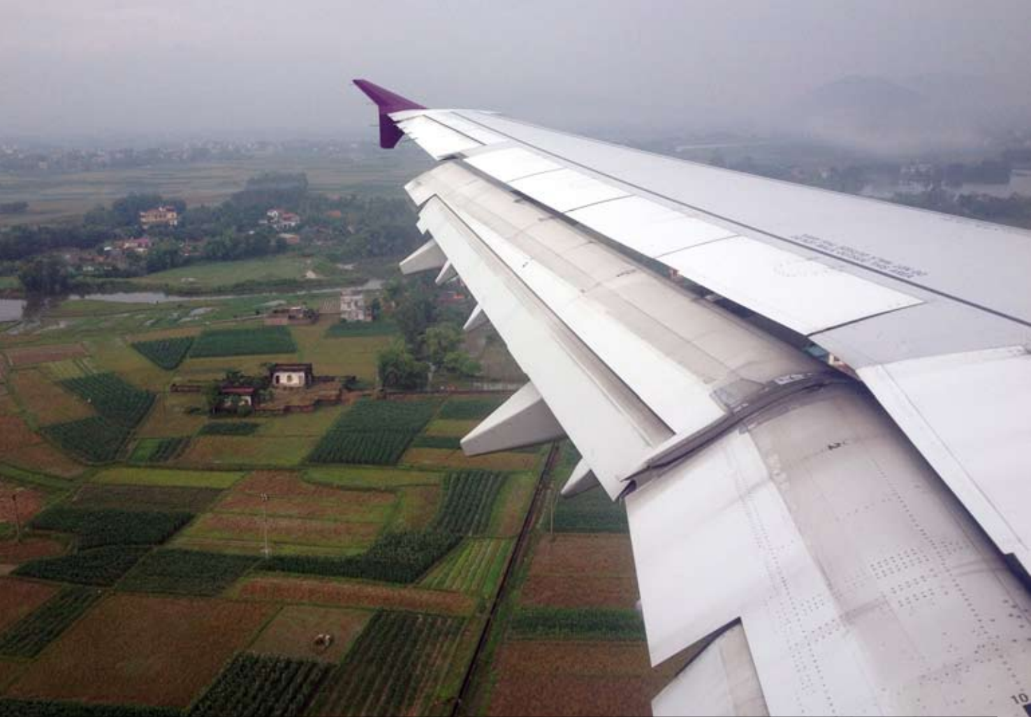
Descending below the cloud cover, there were green farm fields as far as the eye could see.